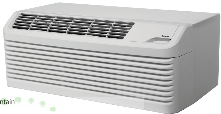
DigiSmart CONTROL BOARD