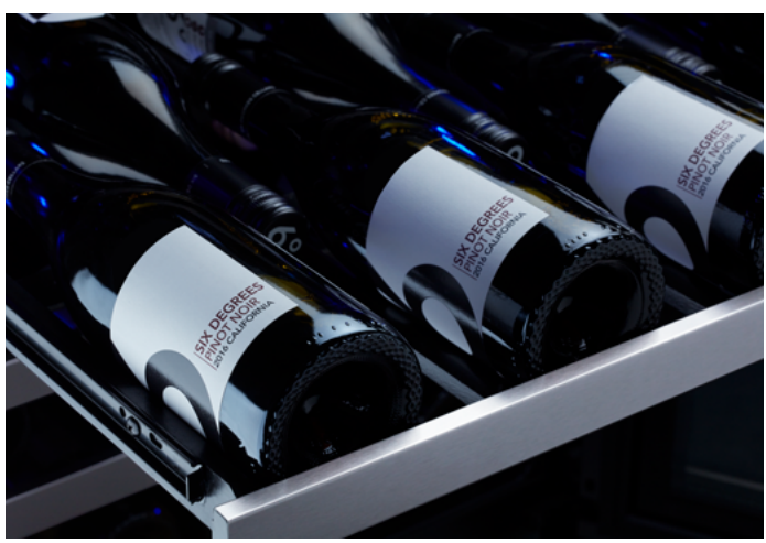
Easily stores Pinot Noir and Chardonnay bottles