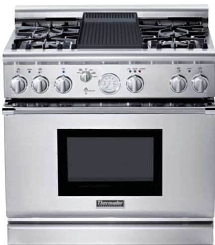
Pro-Grand 36" All Gas Range 4 Burners with Grill