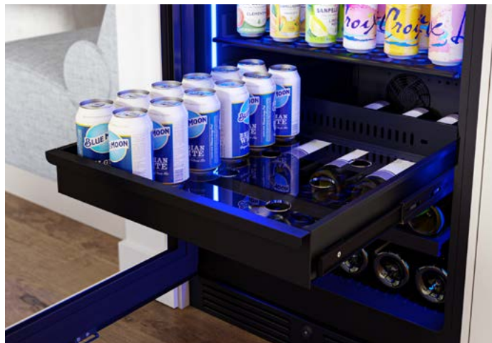
Full-Extension Rollout Bin with Transparent-Gray Glass