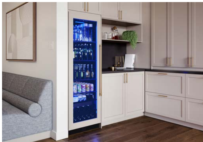
Accommodates custom wood overlay panels