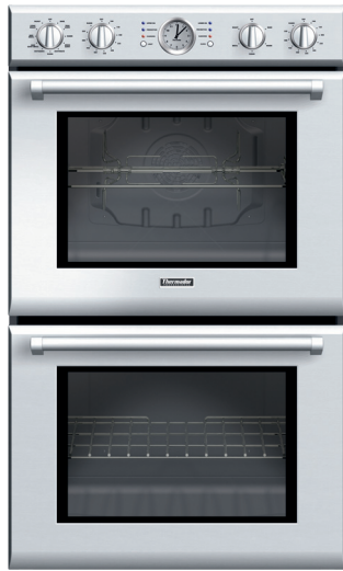
Professional Series stainless steel double oven.