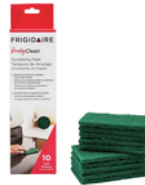
10FFSCRB01 ReadyClean™ Scrubbing Pads