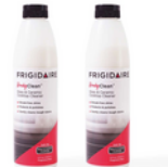
10FFCTCL02 ReadyClean™ Glass and Ceramic Cooktop Cleaner - 2 Pack