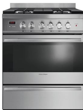
OR30SDBMX1 30" Gas Range

This 30in Freestanding Range gives you the flexibility to prepare several courses simultaneously with an extra large oven, combined with a 4-burner gas hob. The unique design and clean lines in black reflective glass and stainless steel complement the style and elegance of any modern kitchen