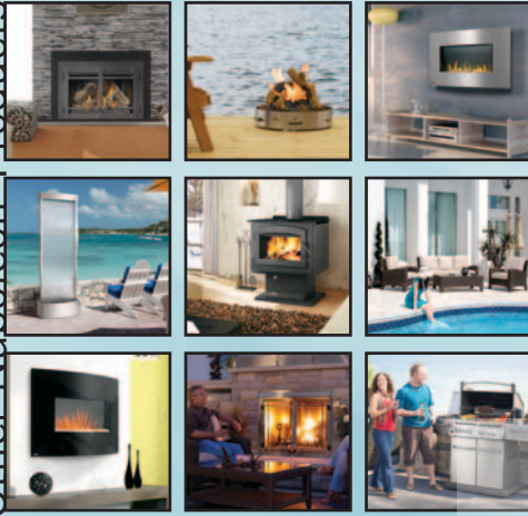
Fireplace Inserts • Patioflames • Gas Fireplaces • Waterfalls • Wood Stoves Casual Furniture • Electric Fireplaces • Outdoor Fireplaces • Gourmet Gas Grills