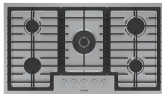
NGM8658UC Stainless Steel