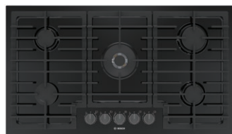
NGM8648UC Black w/Black Stainless Knobs

Also available in: Stainless Steel NGM8658UC