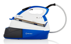
AUTO SHUT OFF