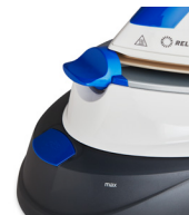
IRON LOCK FOR EASY CARRYING