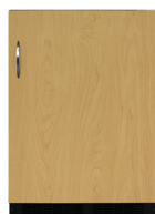
Solid Overlay (Panel Ready)*