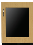
Framed Overlay (Panel Ready)*