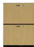
Solid Overlay (Panel Ready)*