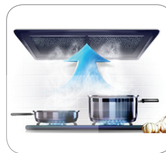
300 CFM Ventilation System