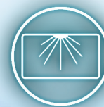
LED Cooktop Light

With Ceramic Enamel inside, it's easy to keep your microwave spotless. Now you can effortlessly remove grease or oil from surfaces.