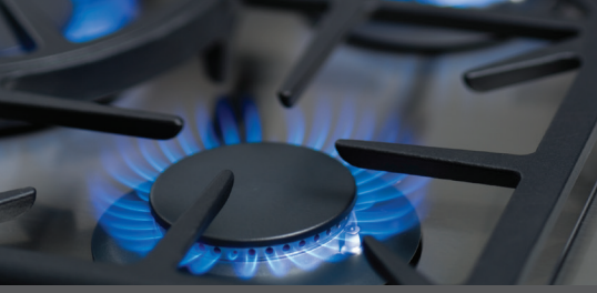
Capital exclusive feature: Power-Flo burners 19,000 BTU to a low delicate simmer.