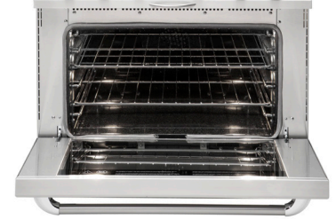
Oven fits full size commercial cookie sheet (26" X 18")