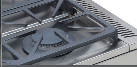
Flush island trim is standard for non-combustible or island trim installations.