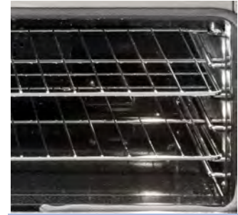
Large Oven Capacity