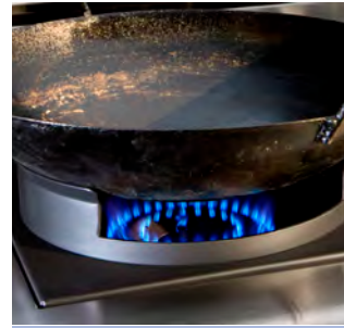
Cast Iron Wok Grate Accessory