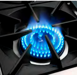
Power-Flo Open Burner 25,000 btu