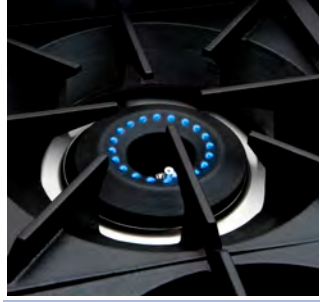
8,000 BTU Small Pan Burner