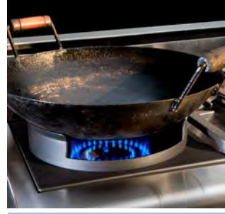
Cast Iron Wok Grate Accessory