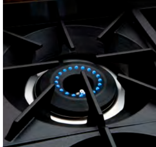
8,000 BTU Small Pan Burner