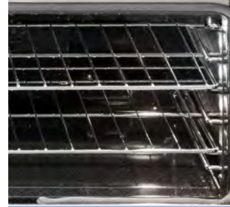
Large Oven Capacity