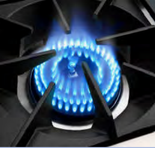
Power-Flo OpenTop Burner 25,000 btus/hr