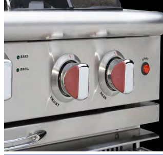
Optional Cabernet red knobs