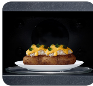
Convection Cooking with Slim Fry