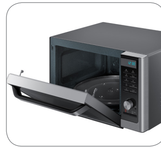
Drop Down Door