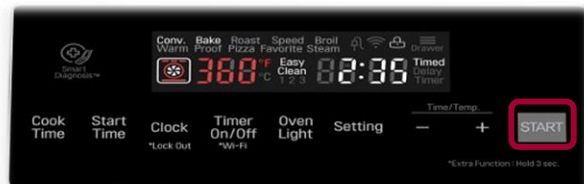
Range Control Panel

You can use the SmartThinQ™ app for wi-fi enabled models to turn on Sabbath Mode. Sabbath Mode will be maintained even after a power outage, but the oven will be off.