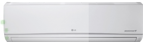
Multi F Standard High Efficiency Wall-Mounted Indoor Units