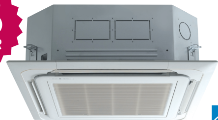
Ceiling Cassette Indoor Units