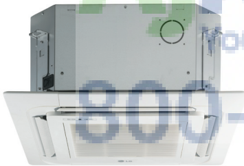
Multi F Ceiling Cassette Indoor Units