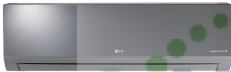
Multi F Art Cool™ Mirror Wall-Mounted Indoor Units

Select from a variety of sleek, elegant indoor units to complement any decor. And the choice is not limited to one type of indoor unit per system—mix and match according to function and style!