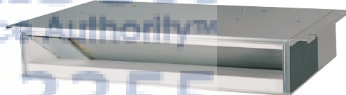
Multi F Ceiling Concealed Ducted Indoor Units