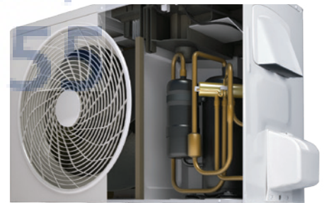
BLDC Motor / Cross-Flow Fan