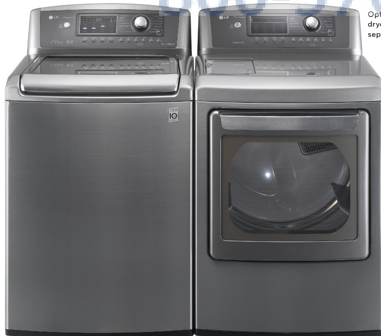
Optional dryer sold separately.