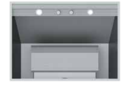
36" Liner Hood Also in 30", 42", 48" and 54" widths

Cooking tends to leave behind a joyous mess. Hestan happily (and silently) handles it. Hestan hoods clear the air of even the most intense cooking odors with best-in-class ventilation while safely collecting 70% more grease than most competitors. The dishwasher cleans everything from stock pots to stemware quietly, carefully and thoroughly with its patented Double Axial Washing System<sup>™</sup>. Then the automatic door pops open to maximize airflow and conserve energy for spot-free drying. It's the next best thing to a magic wand.