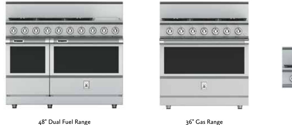
30" and 36" Dual Fuel Ranges also available