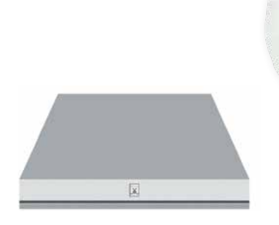
36" Chimney Hood Also in 30", 42", 48" and 54" widths