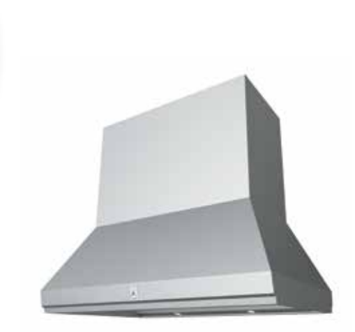
36" Island Hood Also in 42" and 54" widths