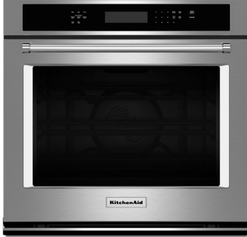
Stainless Steel KOSE507ESS