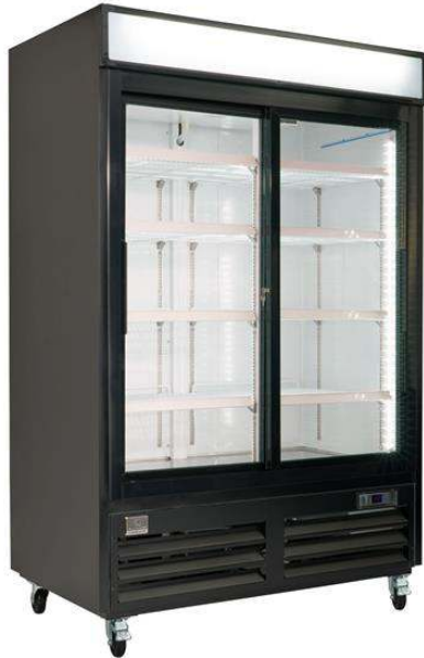
738319 (KCHSGM48R) 2-Sliding Glass Door Full Height Merchandiser Refrigerator 54" Long