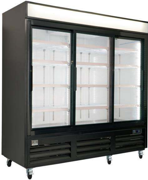
738320 (KCHSGM72R) 3-Sliding Glass Door Full Height Merchandiser Refrigerator 83" Long