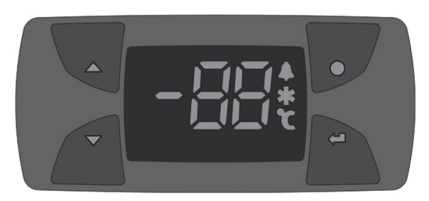
Figure 2. nEW 961 Digital Temperature Controller

Perlick C-Series units come standard with state-of-the-art digital control.