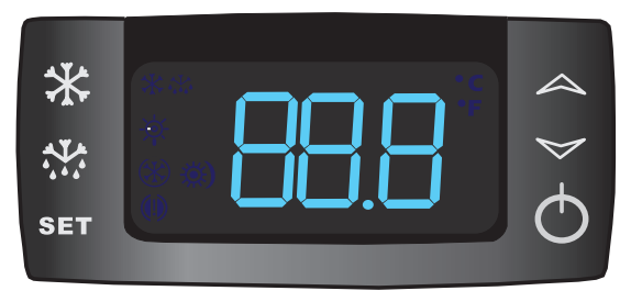
Figure 1. Digital Temperature Controller

Perlick Signature Series, C-Series and ADA Compliant freezer units come standard with state-of-the-art digital control. Please note there are three sets of instructions; one for 24" Signature Series Dual-Zone models, one for C-Series, and another set for 15", 24" Single-Zone and Sottile, and 48" Signature Series and ADA-Compliant Freezer models.