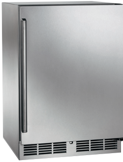
Solid Door Refrigerator/Wine HP24CS-1R