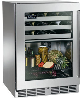
Glass Door Refrigerator/Wine HP24CS-3R