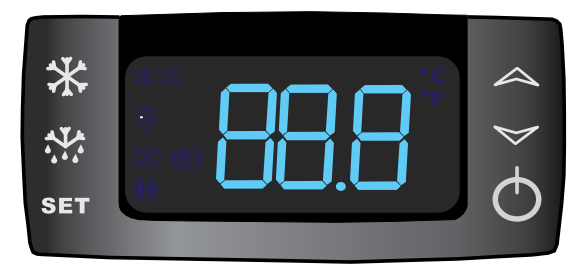
Figure 1. Digital Temperature Controller

Perlick Signature Series, C-Series, Shallow-Depth Series and ADA Compliant freezer units come standard with state-of-the-art digital control. Please note there are two sets of instructions; one for 24" Signature Series Dual-Zone models, and another set for 15", 24" Single-Zone, and 48" Signature Series, C-Series, Shallow-Depth and ADA-Complient Freezer models.