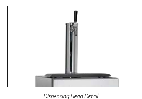
= 10p = 11011;