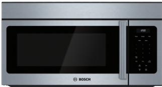
HMV3052U Stainless Steel

Also available in: White HMV3022U Black HMV3062U