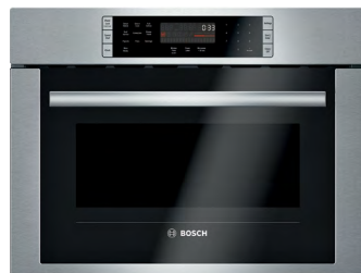
HMC54151UC Stainless Steel

The 24" speed oven pairs the cooking qualities of a conventional oven with the speed of a microwave, designed for smaller spaces.