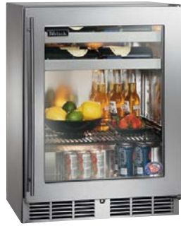
Glass Door Beverage Center HH24BS-3R