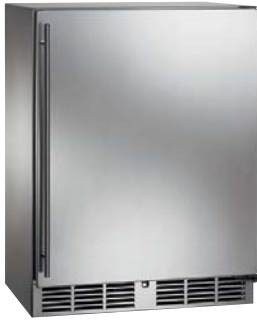
Solid Door Beverage Center HH24BS-1R