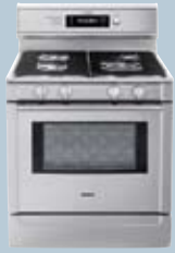
Gas Range HG2528UC