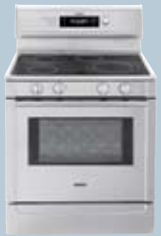
Electric Range HE2528U