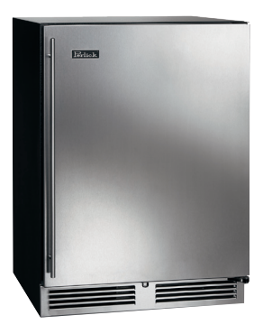
Outdoor Solid Door Model