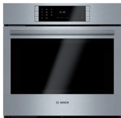
HBLP451UC Stainless Steel

The Bosch wall oven features a SmoothClose door that won't slam shut and a high-resolution TFT user interface.