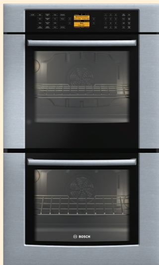
800 Series HBL8650UC Double Oven