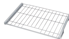
HEZTR301 30" Telescopic Rack