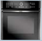
iSlide™ Electric Single Oven