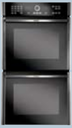
iSlide™ Electric Double Oven