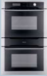
Electric Double Oven