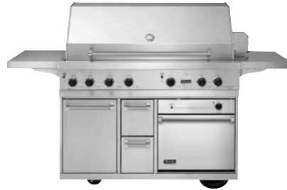
BQC053T1 Outdoor Range™ Ultra-Premium Cart with Oven