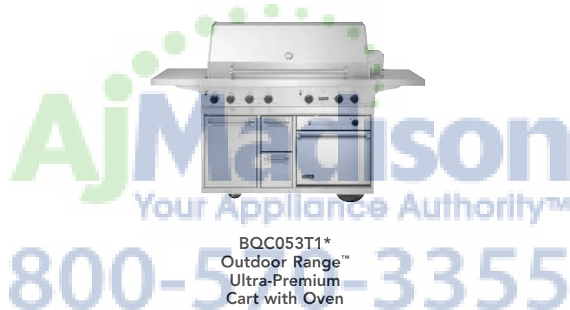
BQC053T1* Outdoor Range™ Ultra-Premium Cart with Oven