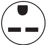
Plug Type (NEMA) 6-15P

¹Warranty 5 year sealed system/1 year full parts and labor.