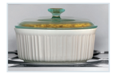
Effortless™ Reheat Reheat almost anything with the touch of a button.

Bake and brown your favorite foods in your microwave oven at the touch of a button-ten preset options allow you to set the heat from 100 to 450