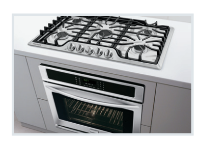
Approved Over Frigidaire® Electric Wall Ovens

Cooktops are approved for installation above any of our Single Electric Wall Ovens.