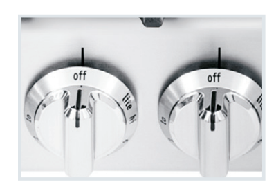
Express-Select® Controls Easily go from warm to boil.