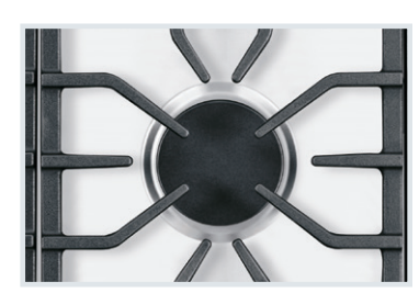
Low Simmer Burner Perfect for delicate foods and sauces.

Continuous grates make it easy to move heavy pots and pans between burners without lifting.