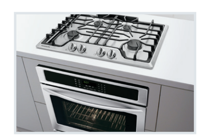
Approved Over Frigidaire® Electric Wall Ovens

Cooktops are approved for installation above any of our Single Electric Wall