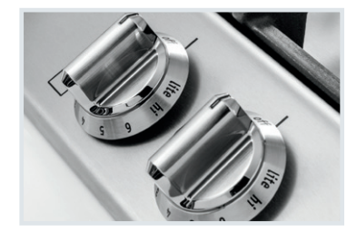
Express-Select® Controls Easily go from warm to boil.

Continuous grates make it easy to move heavy pots and pans between burners without lifting.