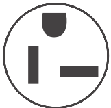
Plug Type (NEMA) 6-20P

1 Warranty 5 year sealed system / 1 year full parts and labor.