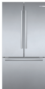
3 Door Stainless Steel Bar Handle B36CT80SNS