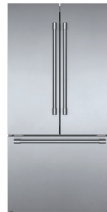
3 Door Stainless Steel PRO Handle B36CT81SNS