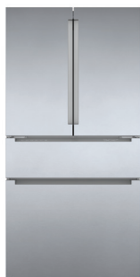
4 Door Stainless Steel Recessed Handle B36CL80ENS