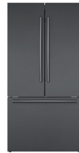
3 Door Black Stainless Steel Bar Handle B36CT80SNB