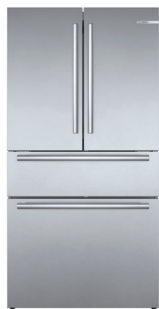
4 Door Stainless Steel Bar Handle B36CL80SNS