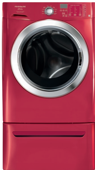
Optional SpaceWise™ Pedestal Drawer Shown