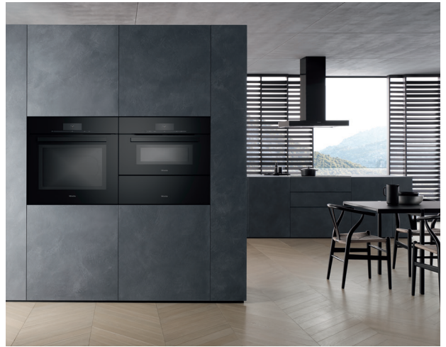
PureLine in Obsidian Black