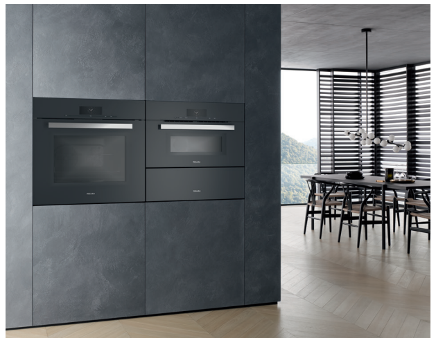
PureLine in Graphite Grey