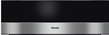
ESW 6885 | Clean Touch Steel™ Item # 30688563USA