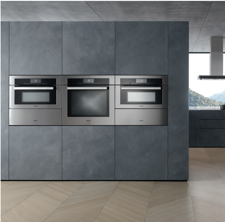
ContourLine in Clean Touch Steel™