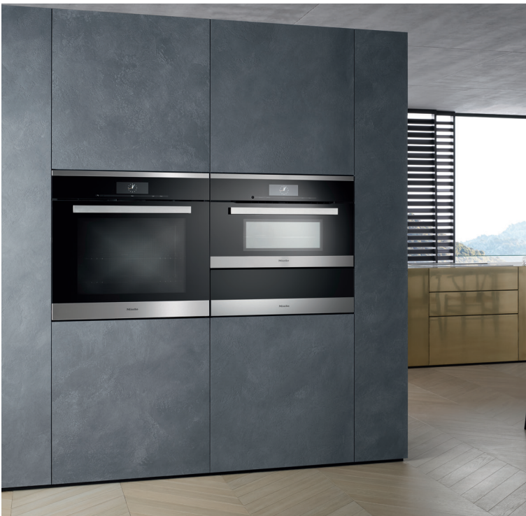
PureLine in Clean Touch Steel™