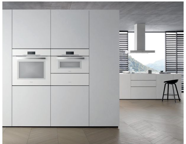
PureLine in Brilliant White