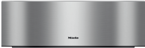
ESW 6585 | Clean Touch Steel™ Item # 30658563USA