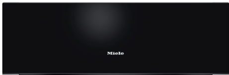
ESW 6885 | Obsidian Black Item # 30688562USA